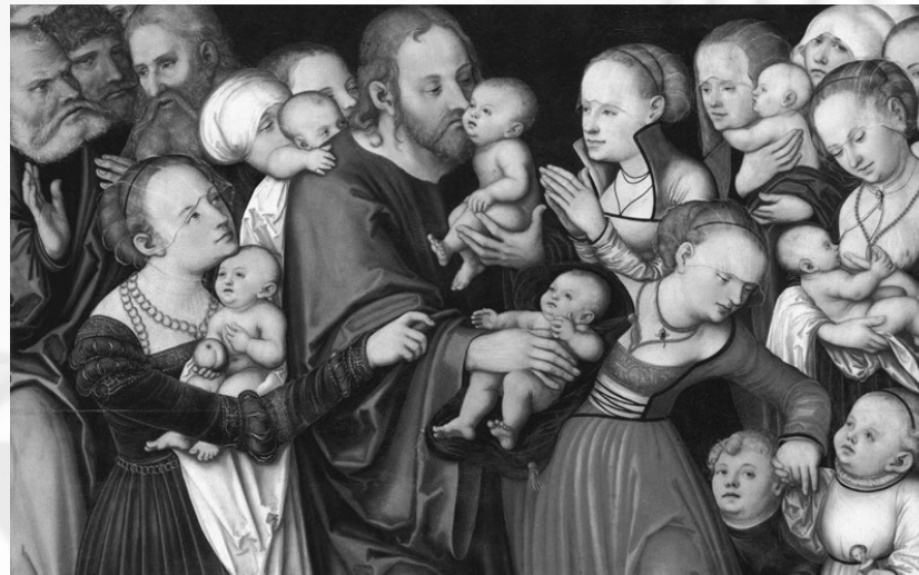
From the Lectionary Christ Blessing the Children Lucas Cranach

Lucas Cranach is probably the artist most closely associated with the Protestant Reformation. He was a friend of Martin Luther who lived and taught in Wittenberg under the protection of the Electors of Saxony. Cranach and his shop produced great numbers of portraits of Luther, his wife, and other Reformers, as well as depictions of such "Protestant" themes as Christ Blessing the Children and Christ and the Woman Taken in Adultery. The range of subject matter in Cranach's paintings is, in fact, quite wide. In addition to religious works, he produced a variety of mythological and secular subjects, probably intended for humanist or courtly patrons. Cranach was also an excellent portraitist.