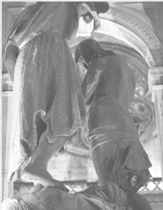
From the Lectionary The Baptism of Christ Cathédrale Saint-Jean-Baptiste (Lyon, France)